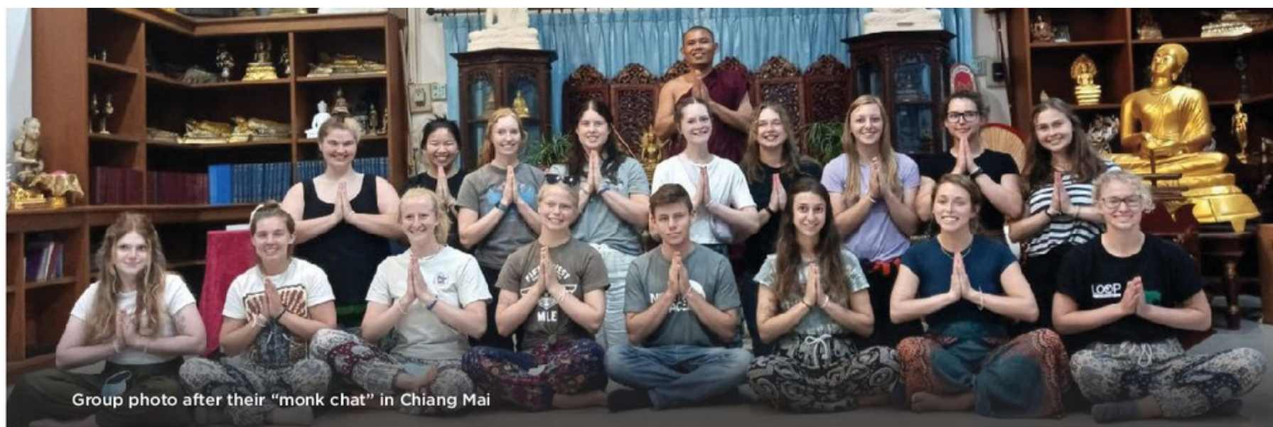
Group photo after their "monk chat" in Chiang Mai

scale. The Elephant Nature Park is home to over 60 elephants who have been rescued from trekking, logging, or forced breeding programs. Many of them had been abused and suffer from chronic injuries or blindness. At the Elephant Nature Park, they are cared for by volunteers from all over the world. Naia helped to feed and care for elephants, as well as learn about their diagnoses alongside an elephant vet. The Elephant Nature Park is also home to over 1,000 animals, including cats, dogs, water buffalo, horses, and cows, and is sustained in huge part by the work of weekly volunteers like Naia.