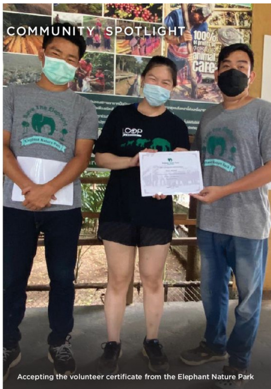
Accepting the volunteer certificate from the Elephant Nature Park