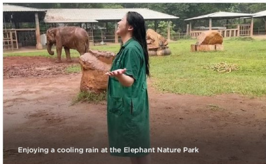
Enjoying a cooling rain at the Elephant Nature Park